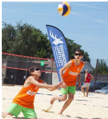
... a few years earlier, the Bello brothers training at Barn Elms

One of the Bello brothers' next main goals is to represent England and challenge for a medal at next year's Commonwealth Games in Birmingham.