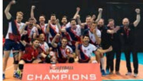
2022 Senior Men's National Champions

As the most successful club in the country we are now in a great position to take on the support of like minded businesses who can help us grow as a centre of volleyball excellence.