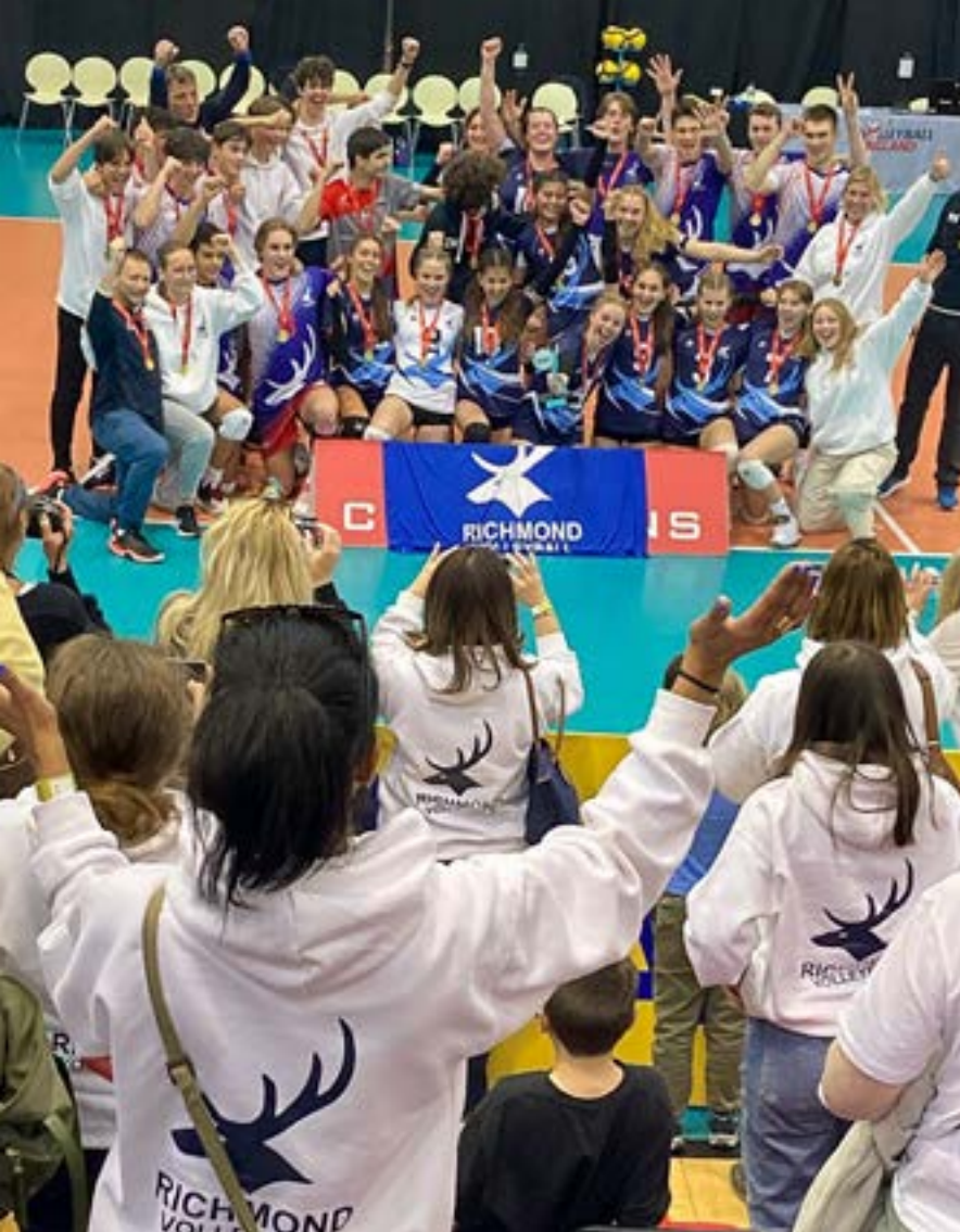
Richmond Volleyball had a strong brand presence at the 2022 National Cup Finals