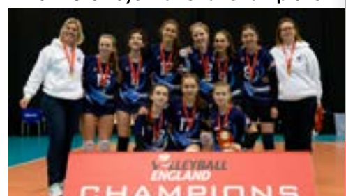
2022 U15 Girls' National Champions