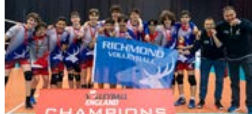
2022 U15 Boys' National Champions