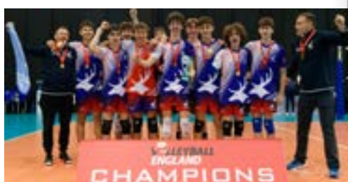
2022 U16 Boys' National Champions