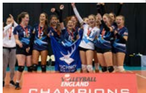
2022 U18 Girls' National Champions