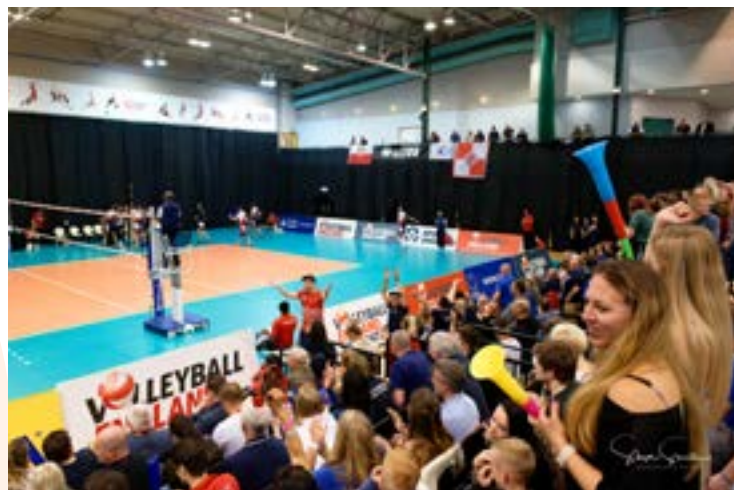
Over 700 spectators purchased tickets to attend the 2022 National Volleyball Finals in Kettering, and a further 6k watched the Men's finals matches via live stream.

Partnership rates from £500 or based on your contribution to specific team/s or events.