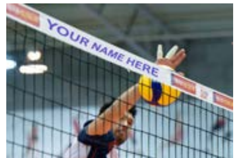
Opportunities for promoting your brand on our kit, nets, supporters hoodies, flags and flyers.