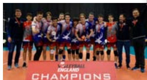
2022 U18 Boys' National Champions