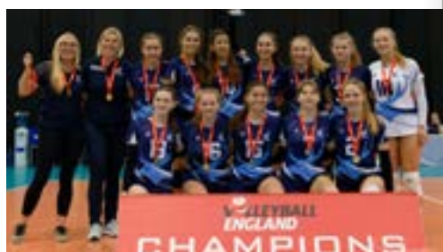
2022 U16 Girls' National Champions